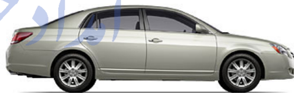
Limited Sedan 5-Speed Automatic (3554) MSRP** Starting At: $34,065.00