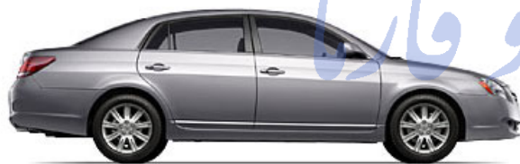
XLS Sedan 5-Speed Automatic (3544) MSRP** Starting At: $31,325.00