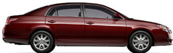
XL Sedan 5-Speed Automatic (3534) MSRP** Starting At: $26,875.00