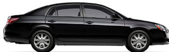
Touring Edition Sedan 5-Speed Automatic (3538) MSRP** Starting At: $29,125.00