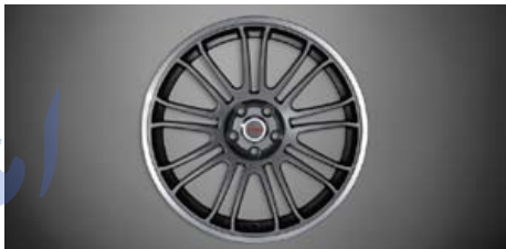
TRD 18-in. multi-spoke alloy wheels