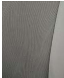
LE fabric in Ash