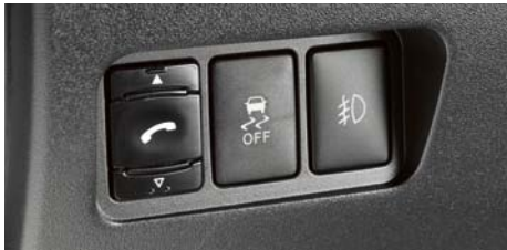
BLU Logic® Hands Free System 20