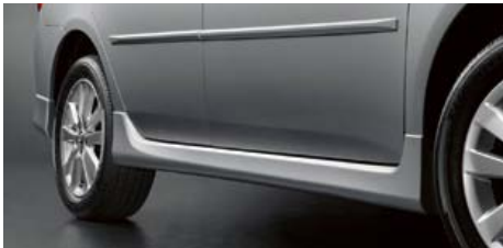
Body side moldings

Add a personal touch to your Corolla with Genuine Toyota accessories. Some accessories may not be available in all regions of the country. See your Toyota dealer for details.