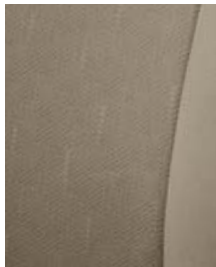
Corolla fabric in Bisque