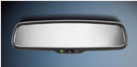
Auto-dimming rearview mirror