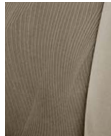
LE fabric in Bisque