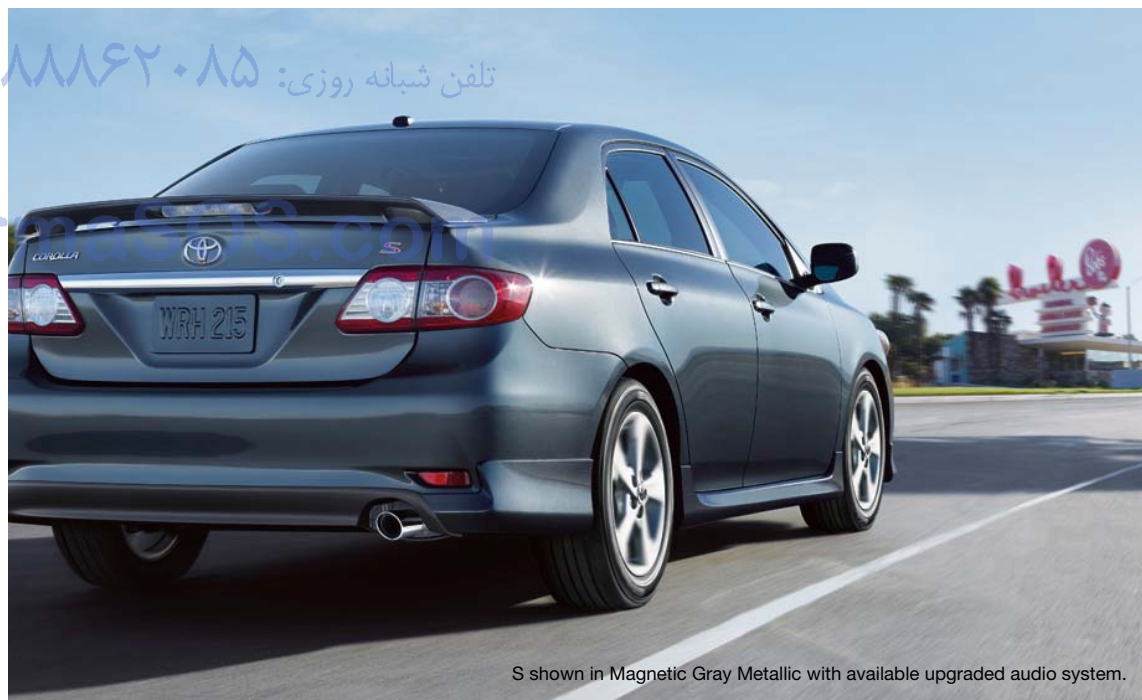
S shown in Magnetic Gray Metallic with available upgraded audio system.

Corolla's impeccable road manners begin with its rigid chassis. Built to resist body flex, it provides a reliable platform so that the suspension can best do its job. The front suspension, mounted to an additional sub-frame to reduce noise and vibration , is tuned for precision handling. In back, the rear suspension employs a torsion-type design that further smooths the ride quality .