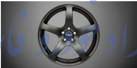
TRD 18-in. 5-spoke wheels (Silver or Black)