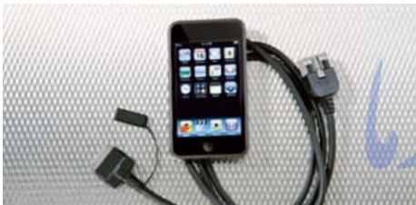
Interface kit 21 for iPod ®11