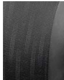
S fabric in Dark Charcoal