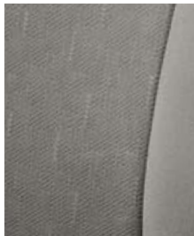
Corolla fabric in Ash