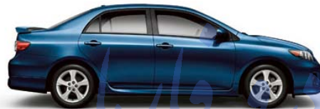
NAUTICAL BLUE METALLIC