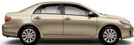
SANDY BEACH METALLIC