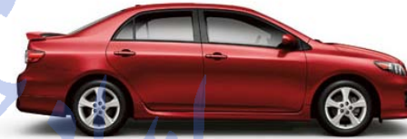
BARCELONA RED METALLIC