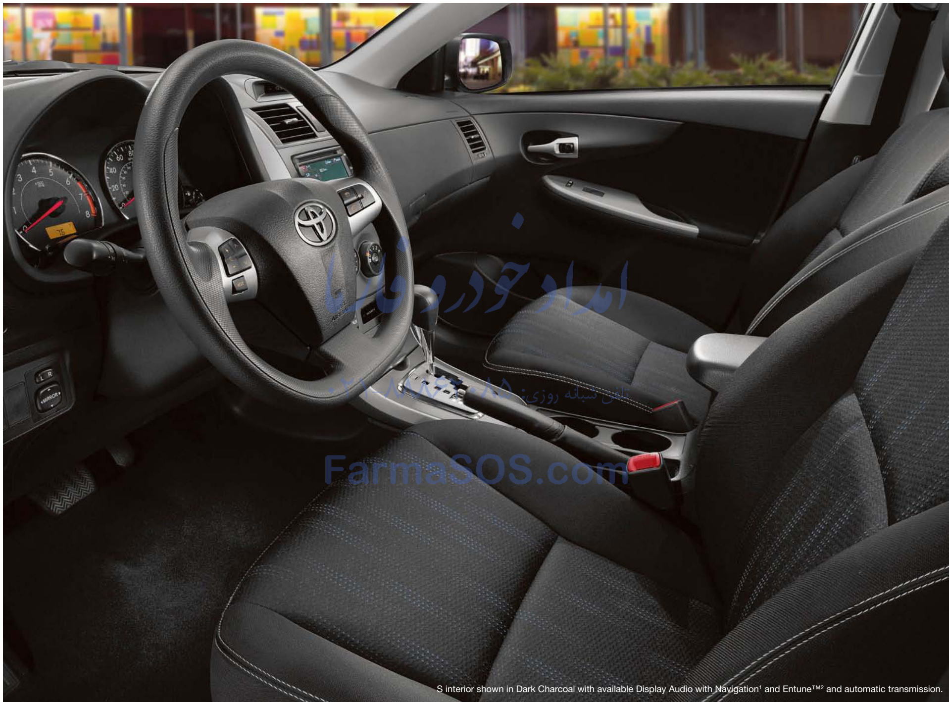
S interior shown in Dark Charcoal with available Display Audio with Navigation 1 and Entune™ 2 and automatic transmission.