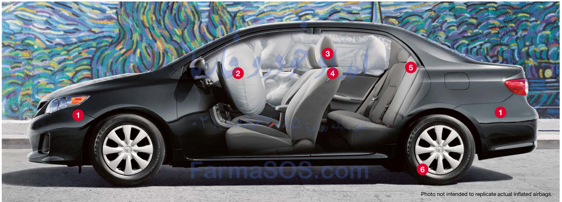
Photo not intended to replicate actual inflated airbags.

Corolla comes standard with active headrests in the front seats that adjust to better support the front occupants' heads in the event of certain lower-speed, rear-end collisions.