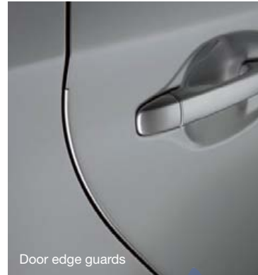
Door edge guards

Alloy wheel locks All-weather floor mats 22 Ashtray cup Auto-dimming rearview mirror BLU Logic® Hands Free System 23 Body side moldings Cargo net Cargo tote Carpet floor mats 22 Door edge guards Doorsill enhancements Emergency assistance kit First aid kit Mudguards Paint protection film 24 Rear bumper protector Rear spoiler Remote Engine Starter TRD 18-in. multi-spoke alloy wheels 25 TRD air filter TRD air filter cleaning kit TRD front strut brace TRD lowering springs TRD oil cap TRD oil filter TRD rear sway bar TRD shift knob TRD wheel installation kit TRD wheel locks Trunk mat