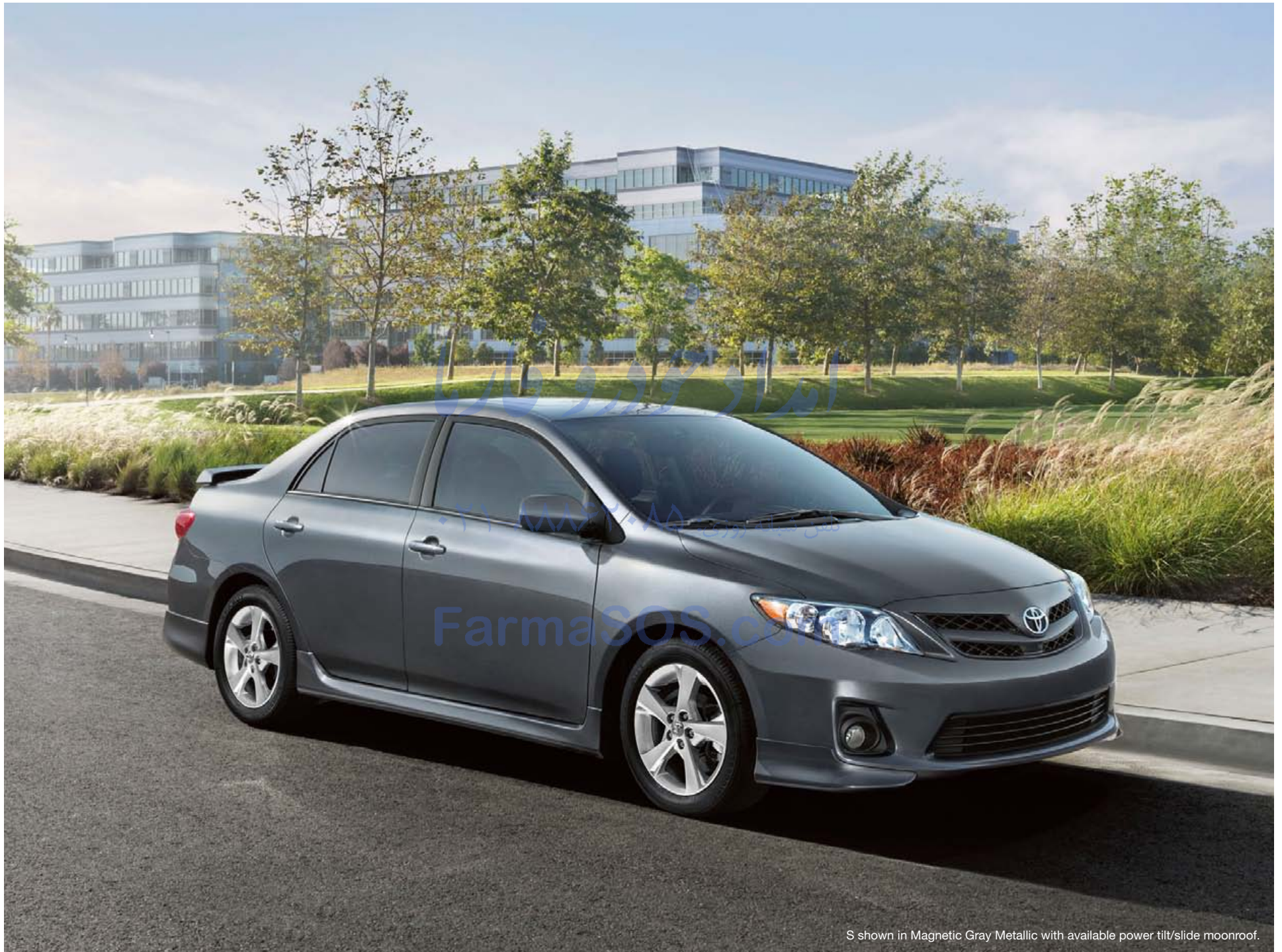
S shown in Magnetic Gray Metallic with available power tilt/slide moonroof.