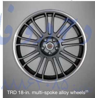
TRD 18-in. multi-spoke alloy wheels 25