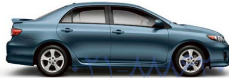
TROPICAL SEA METALLIC