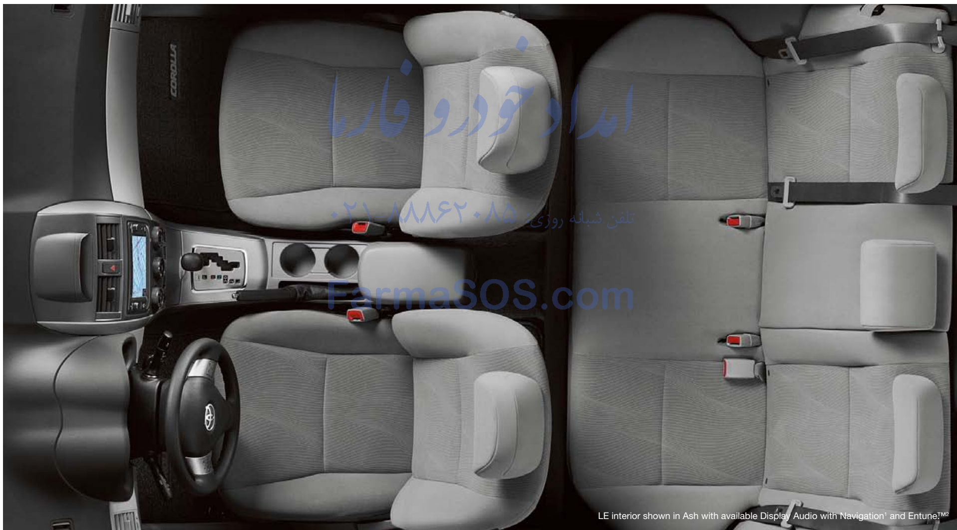
LE interior shown in Ash with available Display Audio with Navigation 1 and Entune™ 2