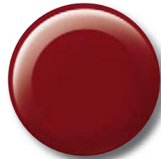
Barcelona Red Metallic