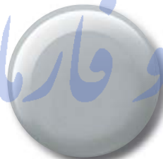
Classic Silver Metallic