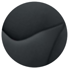
PERSONA SERIES SofTex ® shown in Black

امداد خودرو فارما تلفن شبانه روزی: ۰۲۱-۸۸۶۲۰۸۵