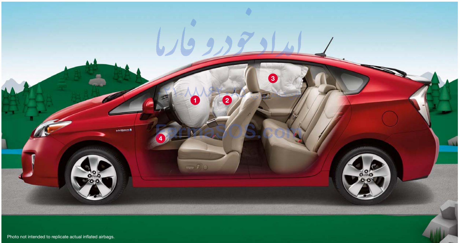
Photo not intended to replicate actual inflated airbags.

This airbag does more than its name suggests. In the event of a frontal collision, it can also help reduce the force on the chest and abdomen.