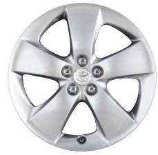
Prius Persona Series 17-in. 5-spoke dark-metal-finish alloy wheel