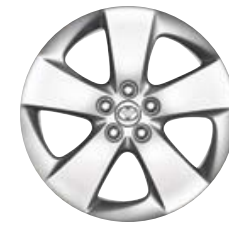
Prius Five 17-in. 5-spoke alloy wheel