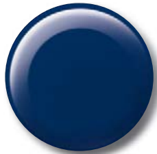
Nautical Blue Metallic