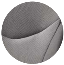
TWO and THREE fabric shown in Dark Gray