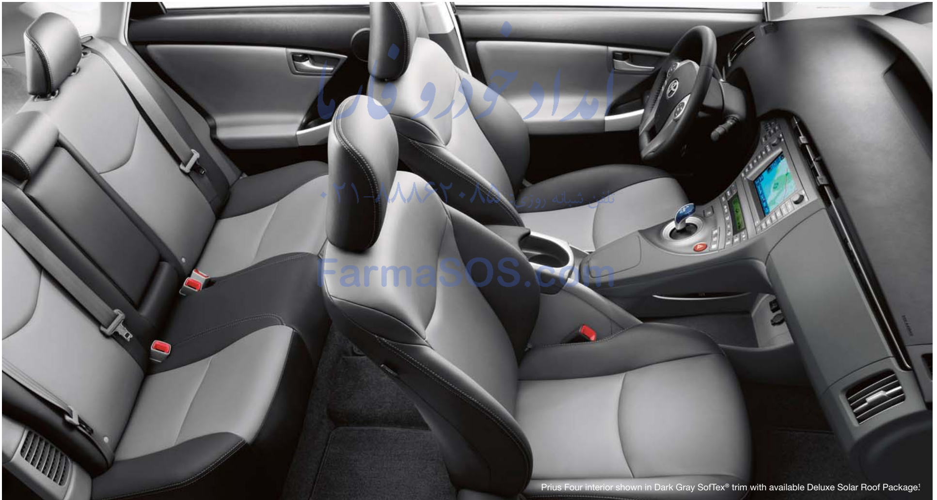
Prius Four interior shown in Dark Gray SofTex® trim with available Deluxe Solar Roof Package!

Getting comfortable is easy, thanks to the available 8-way power-adjustable driver's seat with power lumbar support that lets you find your ideal position.