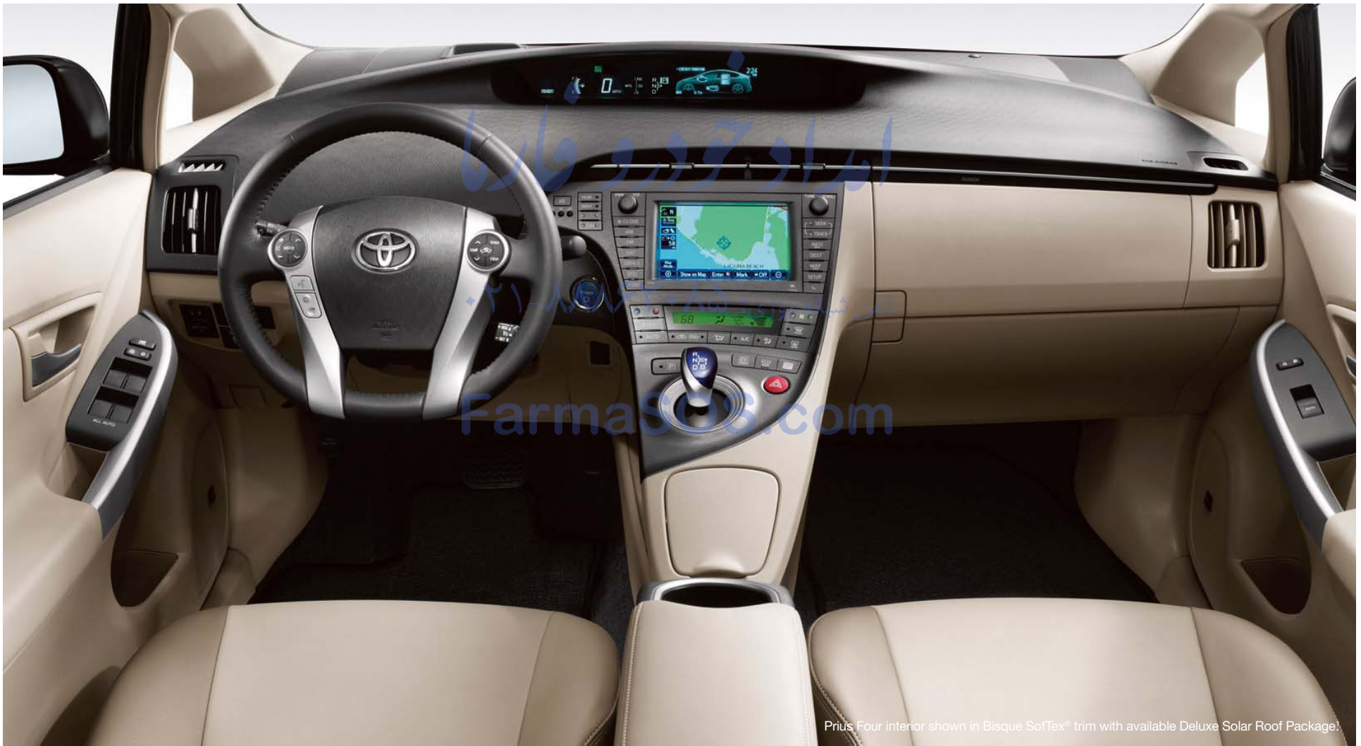
Prius Four interior shown in Bisque SofTex® trim with available Deluxe Solar Roof Package!

1. See footnote 8 in Disclosures section.