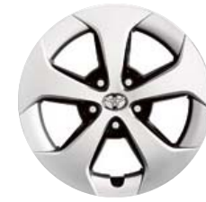
Prius Two, Three and Four 15-in. 5-spoke alloy wheel with full wheel cover