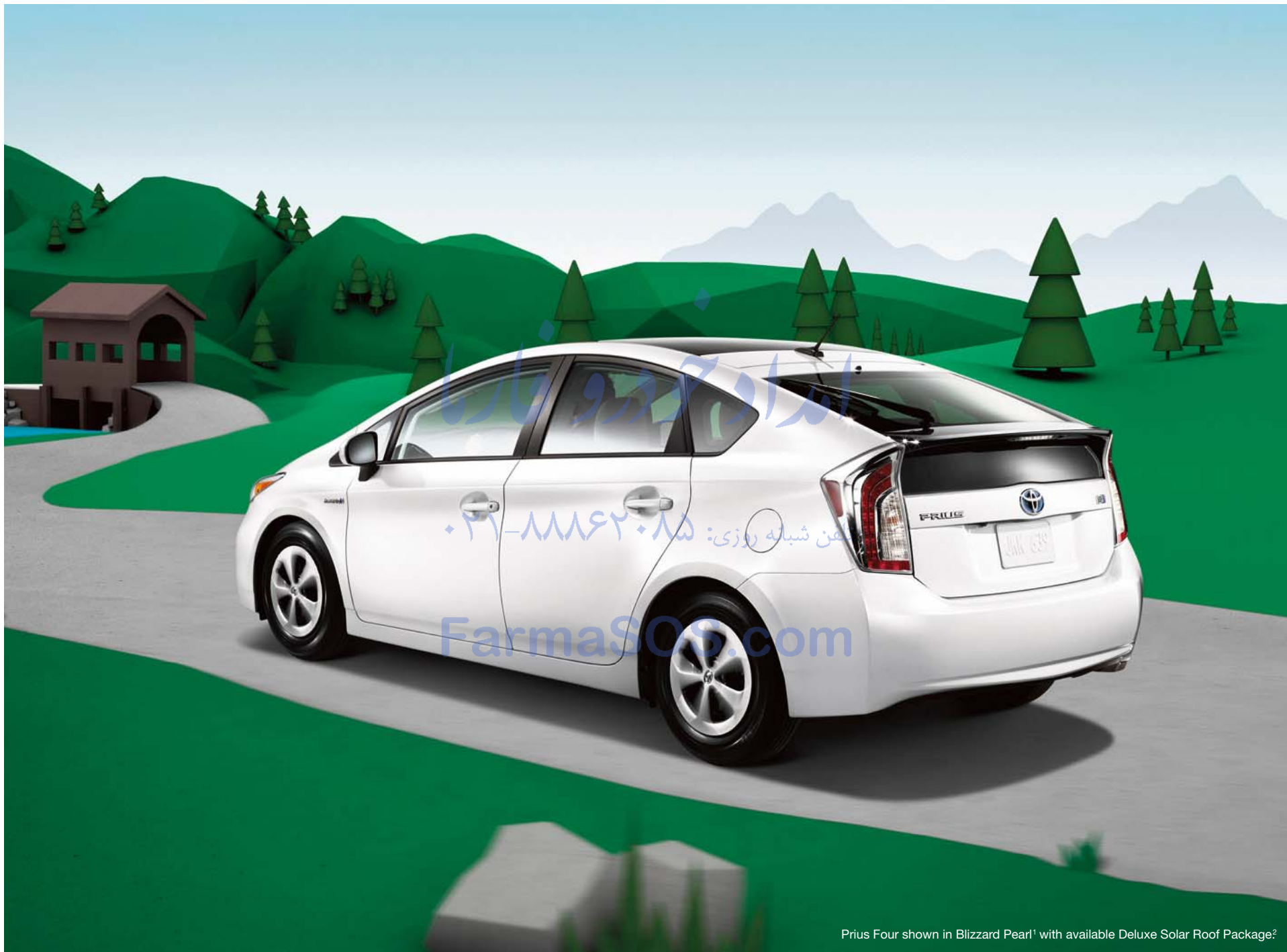
Prius Four shown in Blizzard Pearl 1 with available Deluxe Solar Roof Package 2