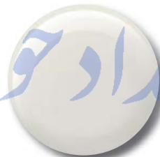
Blizzard Pearl 1