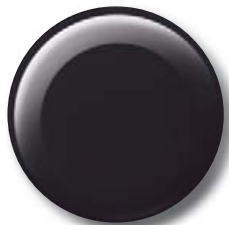
Winter Gray Metallic