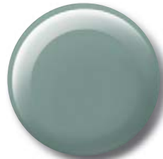
Sea Glass Pearl