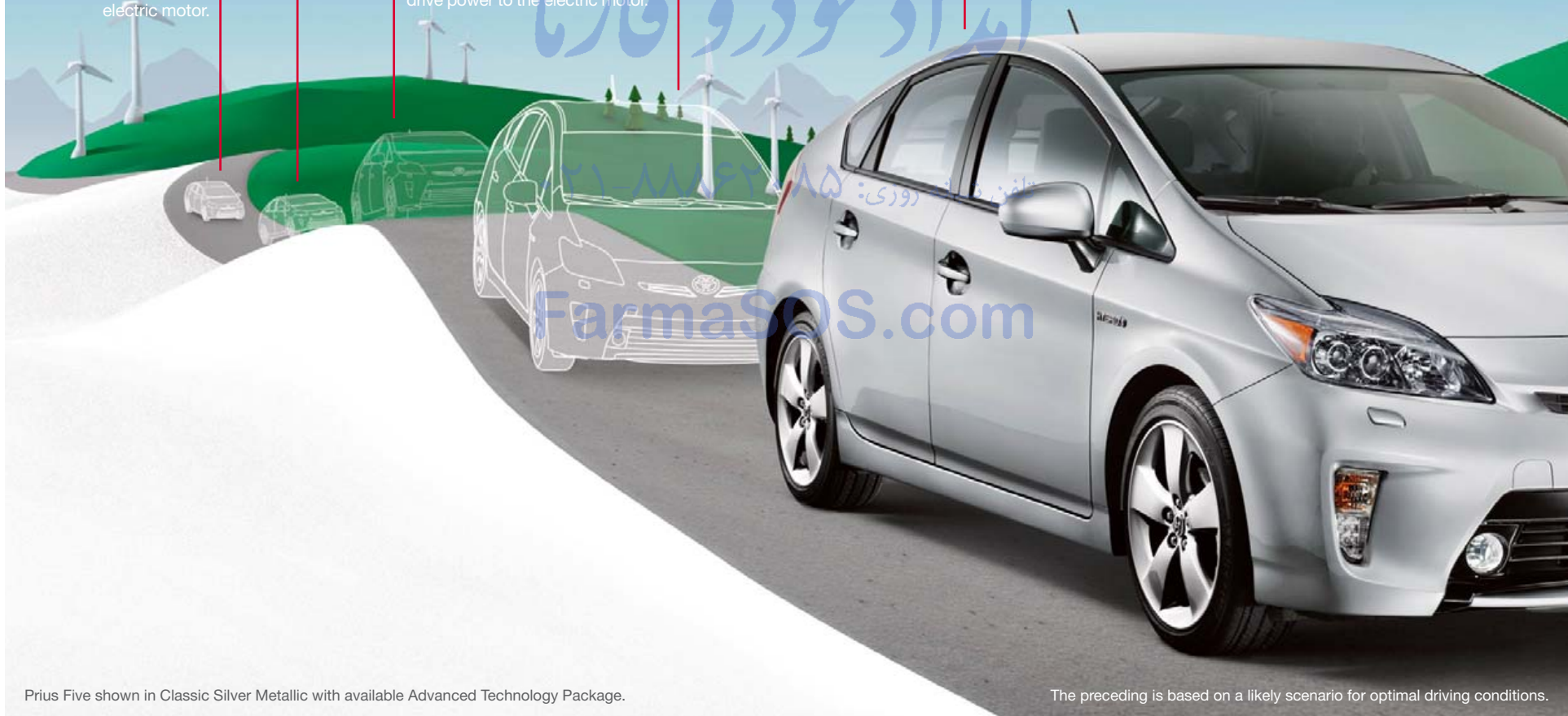
Prius Five shown in Classic Silver Metallic with available Advanced Technology Package.

GASOLINE ENGINE The series-parallel Hybrid Synergy Drive® helps the gasoline engine deliver both power and fuel efficiency.