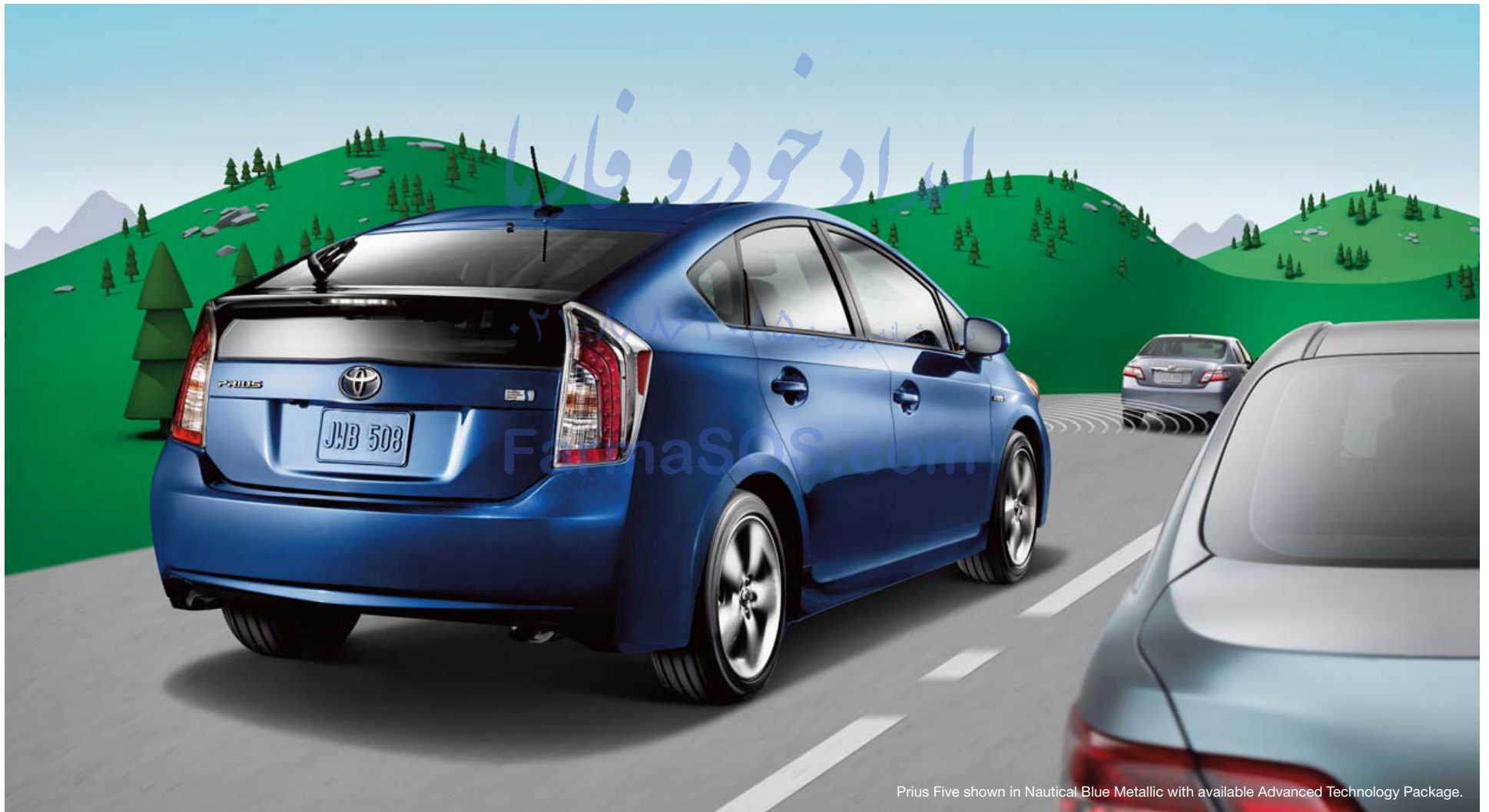
Prius Five shown in Nautical Blue Metallic with available Advanced Technology Package.